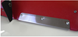
80471102 SS Wear Panel Center Dividers Only Not for End Panels