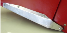
80471100 & 1101 SS Snout Wear Strips