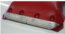
80471103 SS Rear Wear Panel

Adapter Kits to mount 1000 series (1083, 1063, 1084) on