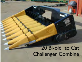
20 Bi-fold to Cat Challenger Combine

Snouts can be raised to vertical position to reduce road and storage width. Ends can be removed easily for maintenance. (no tools required) Designed especially for lower profile Corn Heads.