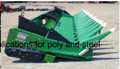
End Deflectors Fits many applications for poly and steel