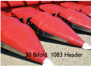
30 Bifold 1083 Header