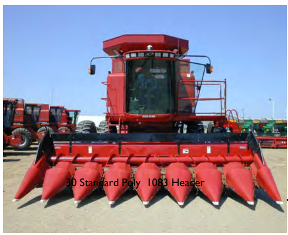
30 Standard Poly 1083 Header

Poly available for corn heads manufactured by JD IH NH GL