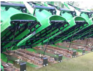
30" Bifold 843JD hinged on rear for maintenance.